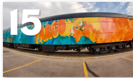
15 Train Cars Corner of Main & Broadway