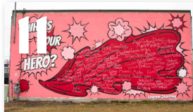
11 Pink Hero Mural 1st Ave & 12th St