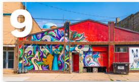
9 Peacock Corner of 6th Ave N on Roberts St.