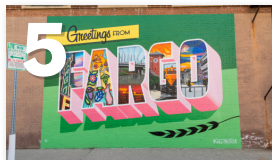
5 Greetings From Fargo 641 1st Ave N (behind Orange Records)