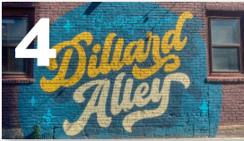
4 Dillard Alley 303 Roberts St