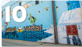
10 Penguins 8th St between Main Ave & 1st Ave S