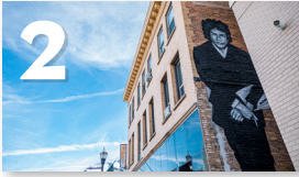
2 Bob Dylan 413 Broadway N, Fargo