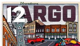
12 Postcard Fargo Alley on 2nd Ave between Roberts and Broadway