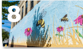
8 Native Prairie 23 8th St S, Fargo