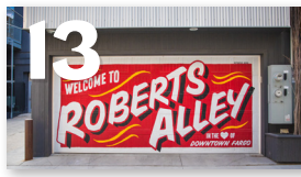
13 Roberts Alley Alley on 2nd Ave between Roberts and Broadway