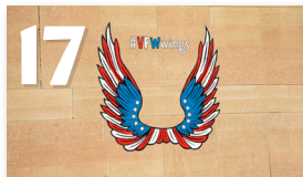
17 VFW Wings 202 Broadway N