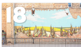
18 Wheat Mural 300 Broadway in the alley