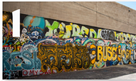
1 Art Alley 1st Ave N between 4th St and 5th St *Art changes frequently*