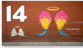
14 Silver Linings Wings 123 Broadway N