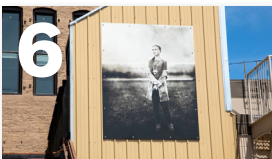
6 Creta Thurnberg 614 Main Ave (behind Front Street)